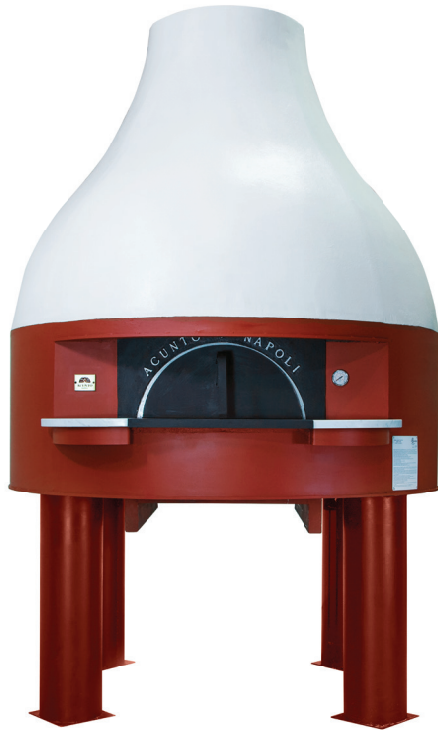
Standard Acunto Vesuvio 120 Model, shipped from Acunto factory, with removable legs