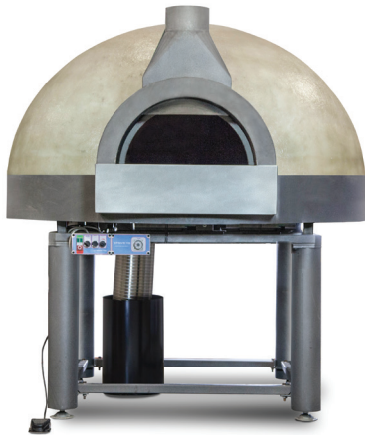
Standard Pavesi Bistro Twister 110