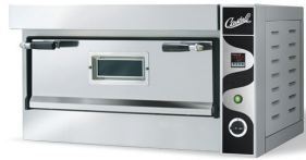
Caldo Single Wide Deck Warming Oven SPB/3