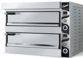
Caldo Double Deck Warming Oven SPB/2C