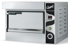
Caldo Single Short Deck Warming Oven SPB/1