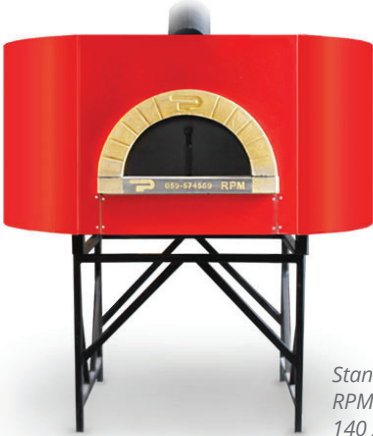
Standard Pavesi RPM Traditional 140 x 180