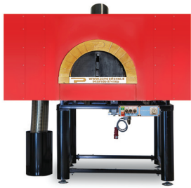
Standard Pavesi Wall Twister PVP 110 Wood/Gas